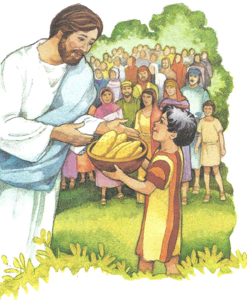
Jesus fed people who were hungry.

Tell these stories about Jesus to your family.